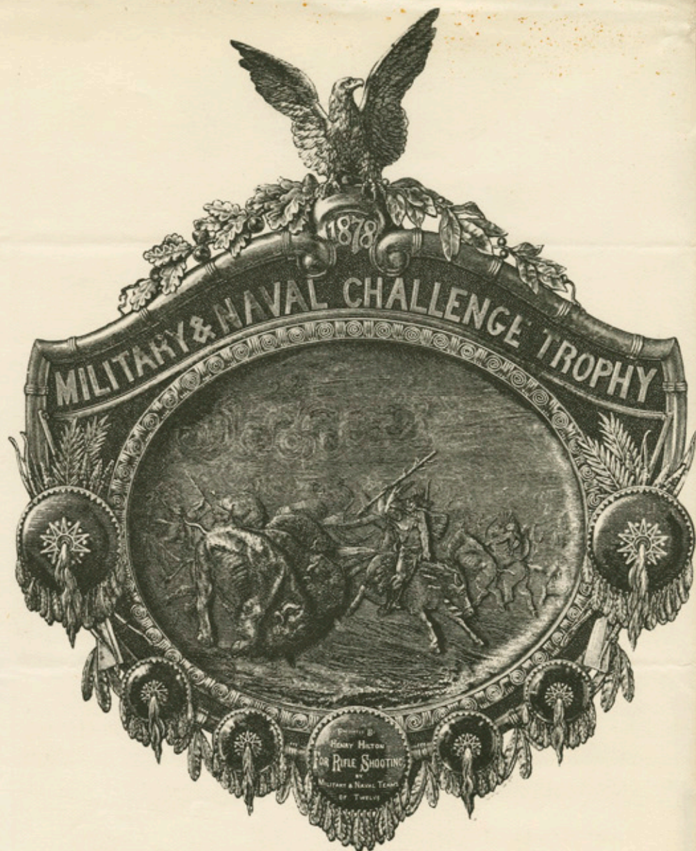
THE "HILTON TROPHY." FIRST PRIZE IN THE INTERNATIONAL MILITARY MATCH, To be Shot at Creedmoor, September 16, 1880.