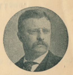
Governor THEODORE ROOSEVELT. 1899.