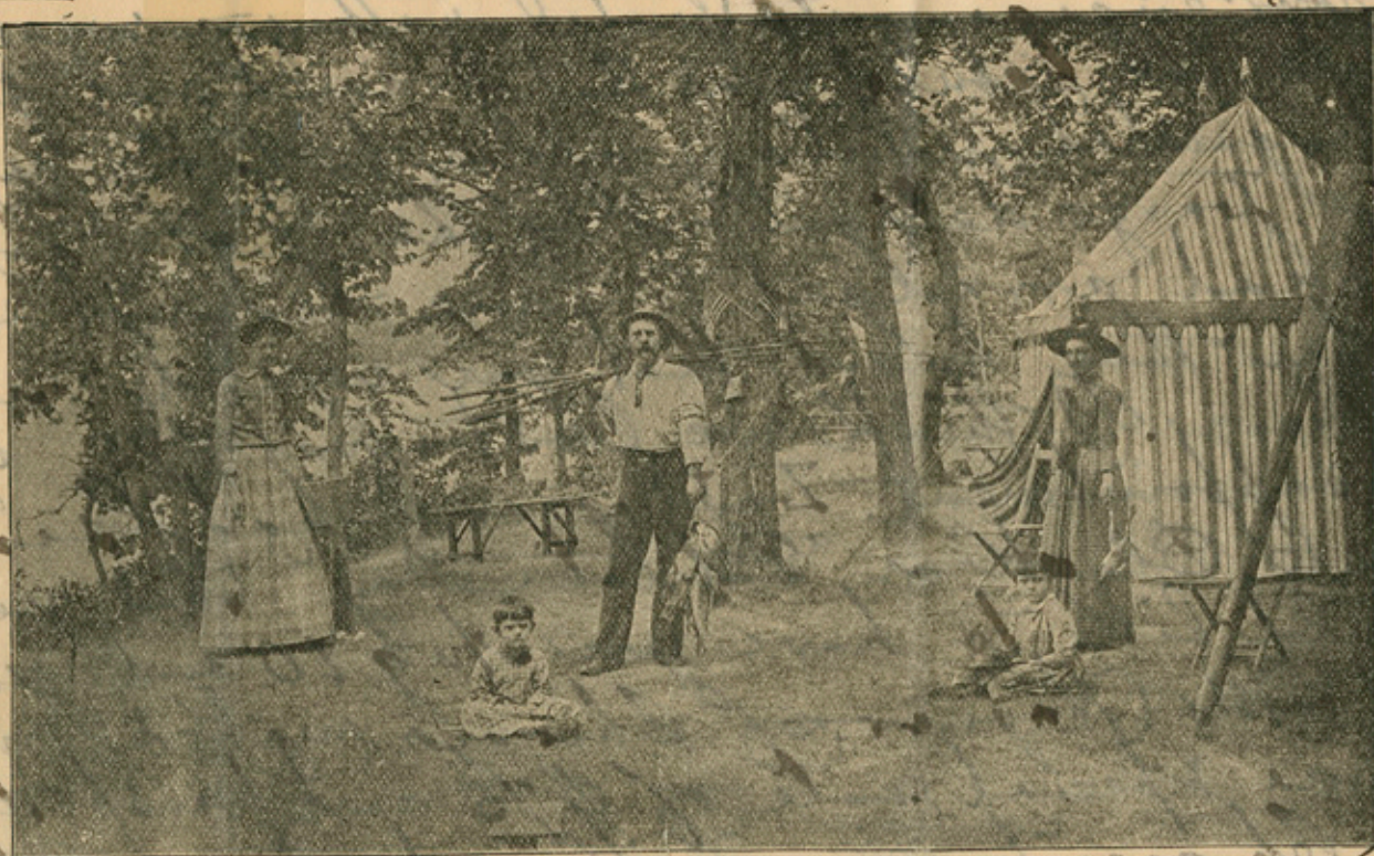
A FAMILIAR CAMP LIFE SCENE AT CLEAR LAKE.