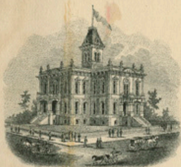
THE REPORTER, YAMHILL, ORE.

CIRCUIT COURT: Fourth Monday in March and September. COUNTY COURT: 1st Monday of each month. PROBATE COURT: Tuesday. COMMISSIONERS: Wednesday succeeding.