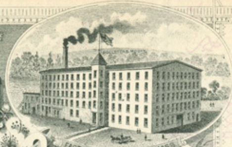
FACTORY AT LEOMINSTER, MASS.