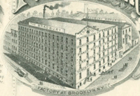
FACTORY AT BROOKLYN, N.Y.