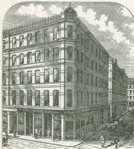
41-45 FRANKLIN ST. (Corner of HAWLEY.)

ALL GOODS RECEIVED AT No. 2 COLLEGE STREET.