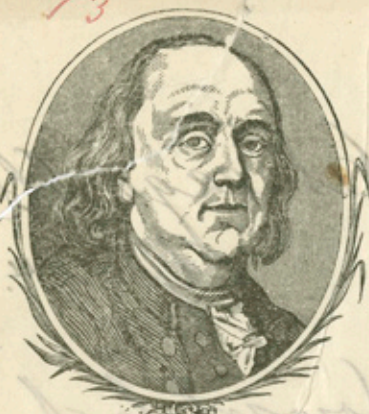
BLANK No. 1.