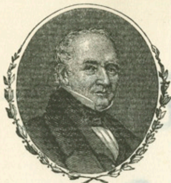
AUGUSTUS GRAHAM, FIRST BENEFACITOR OF THE INSTITUTE.