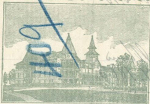
ST. MARY'S HALL.